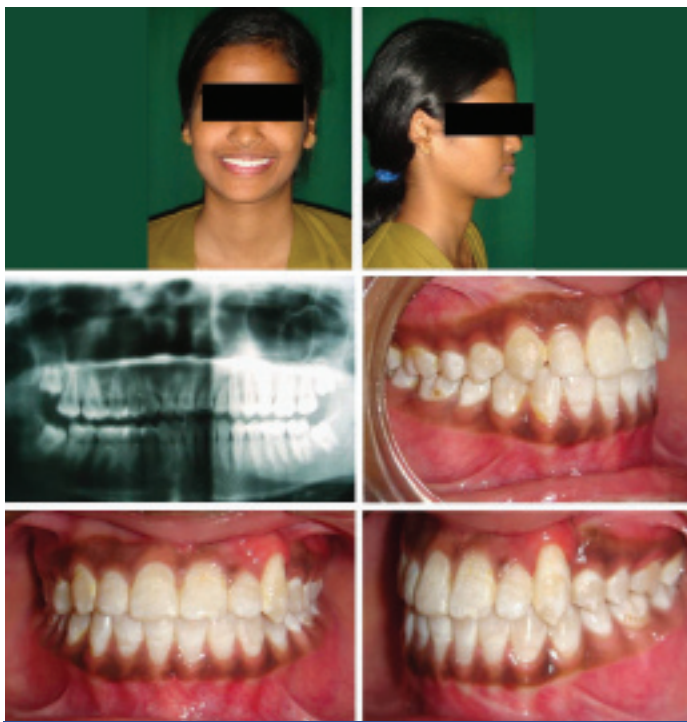
[Table/Fig-3]: Post-treatment extra oral and intra oral photographs with post treatment OPG.

The gingival inflammation in relation to the canine was addressed by scaling and root planning, following which it resolved was over a period of 2-3 months. [Table/Fig-3] showing post treatment extra oral, intra oral photographs and OPG.